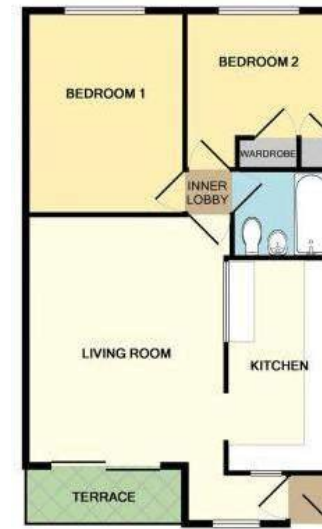
This Floor Plan is for guidance only and is NOT to SCALE Made with Metropix ©2015